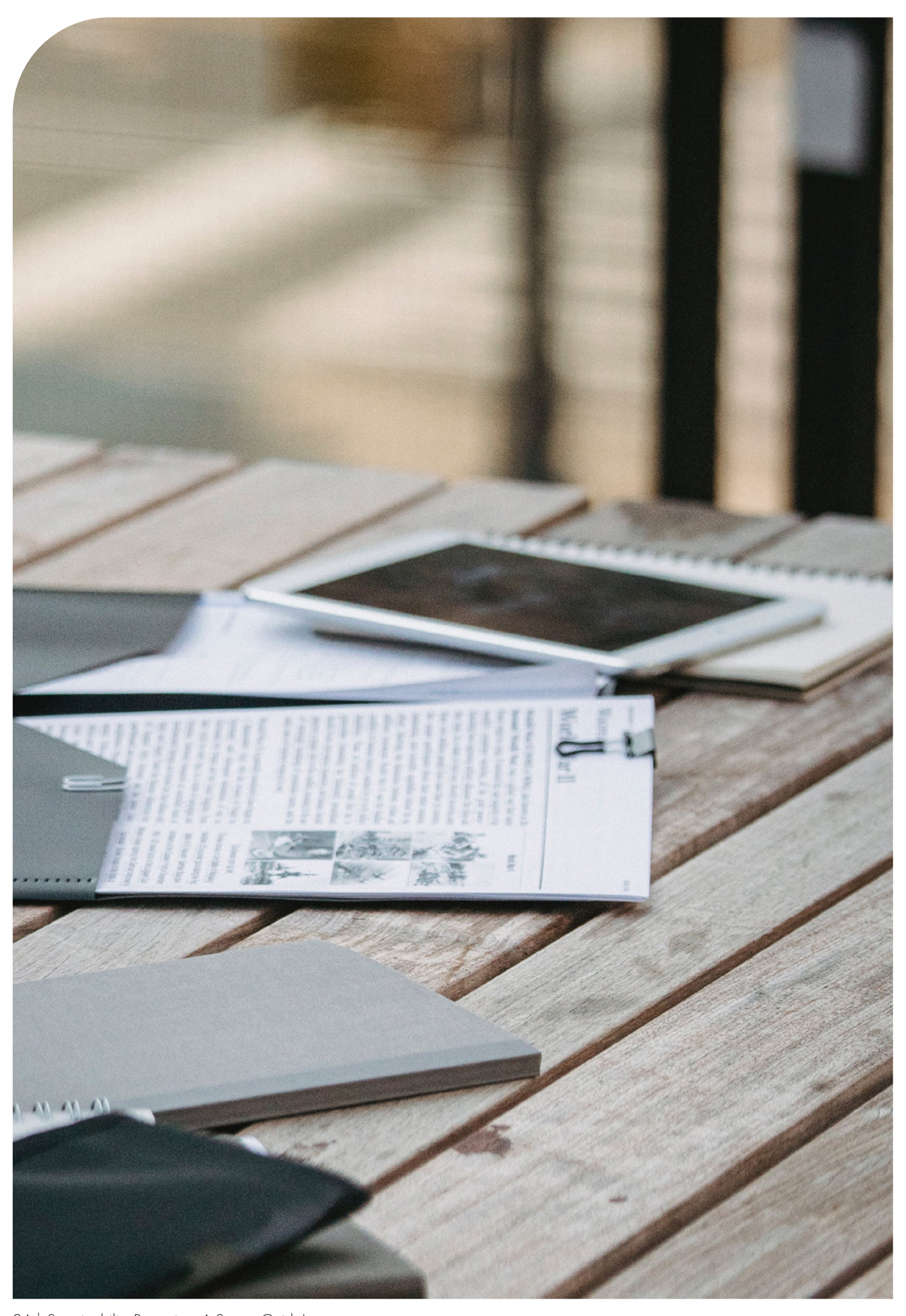
24 | Sustainability Reporting: A Starter Guide!